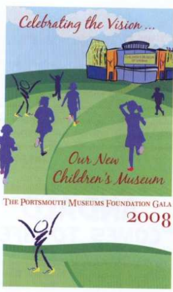
THE PORTSMOUTH MUSEUMS FOUNDATION GALA 2008

click on "Help support the Children's Museum of Virginia" click on "give online" and follow instructions